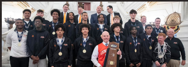
Welcoming the PIAA 6A state champion Central York School District Panthers basketball team to the Capitol.