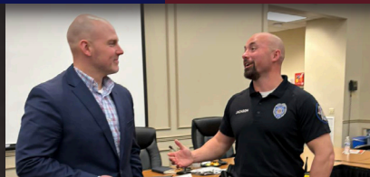
I enjoyed meeting with Northeastern School District administrators, school counselors and board members.