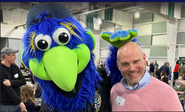
Here I am with DownTown, the York Revolution mascot.

I continually look for ways to keep the 47th Legislative District informed. In addition to my website, weekly e-Blasts and social media pages, I often appear on radio or television programs to discuss the issues we are tackling in Harrisburg. Some of the recent topics include college protests and free speech, protecting children from unfair labor practices, and the governor and state Liquor Control Board's overreach during and post-COVID. Is there a topic that you want to learn more about? Drop me an email and let's chat!