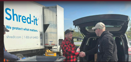
A lot of documents were safely destroyed at our shredding event!